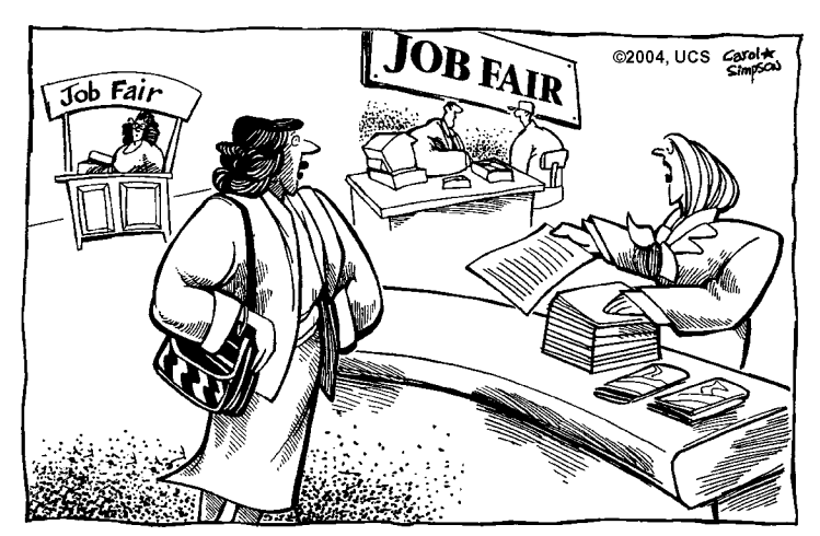
"This is the new economy, Instead of recruitment brochures, we hand out sample layoff notices."

We must educate all of our members in order for the bargaining committee to be successful this year. There are only how many paydays until June 26? Take a few minutes in the morning before work to discuss past bargainings. Take part in Rallies when given the opportunity. Attend a Union meeting, voice your opinion and above all stick together! We will not accept a substandard contract from a company making billions of dollars!