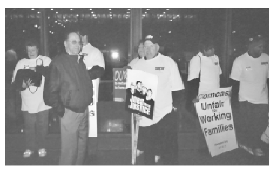
Local 21 members attend the International Human Rights Day rally.