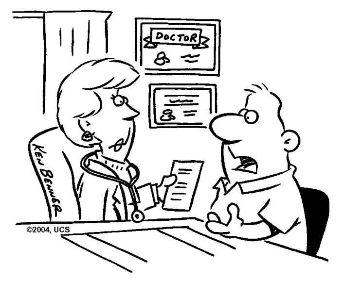
"Can't you keep running tests until you find something covered by my HMO?"

Now comes the lesson. In our locations everyday we see management doing what can only be called Union busting. Whether it is a statement like, "Maybe there will be more overtime for you senior guys now that they are laying these new guys off." Or, "If these old guys would just retire we'd have room for you younger guys." Guess what SBC? It's not working. Do we need to work on building Solidarity and Unionism in our locations? Of course, there is always work to be done. We can always be stronger. The lesson I learned this holiday season? We are a brotherhood. We take care of our own.